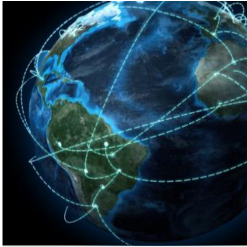
Internet of Things