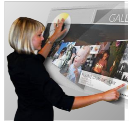
Wearable Technology & Natural U.I.