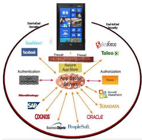
Enterprise App Stores & HTML5 Growth