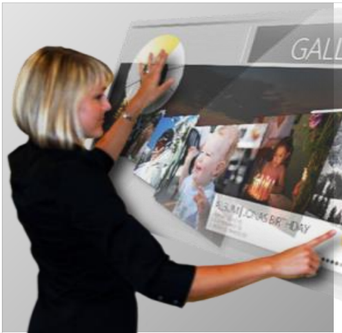
Wearable Technology & Natural U.I.