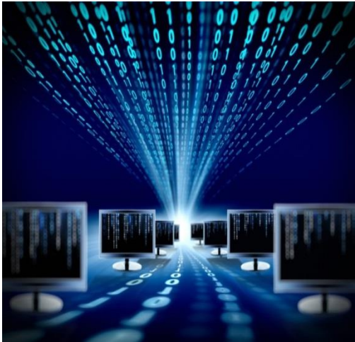
End-User Driven Actionable Analytics

Actionable Analytics Will Be Driven by Mobile, Social and Big Data Forces: Business today requires on-demand, real-time decision making and forward-looking analytics from mobile devices.