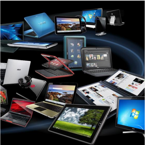
Integrated Devices & Ecosystems

Integrated Devices and Ecosystems: Trends shifting to more integrated systems and ecosystems and away from loosely coupled heterogeneous systems.