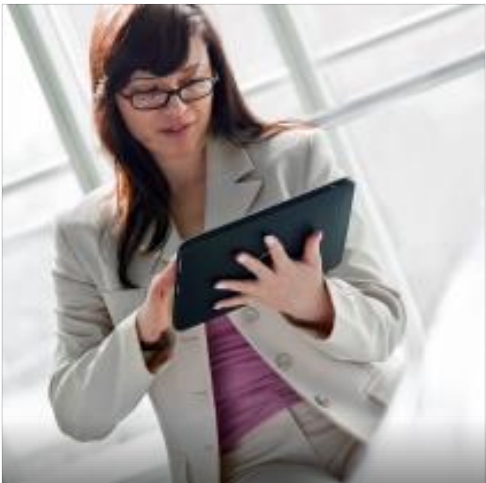
Enterprise Risk Mgt. & Cybersecurity

Ent Risk Management and Cybersecurity: Our increasingly heavy dependence on various digital infrastructures (government and corporate) has made them strategic assets to be protected