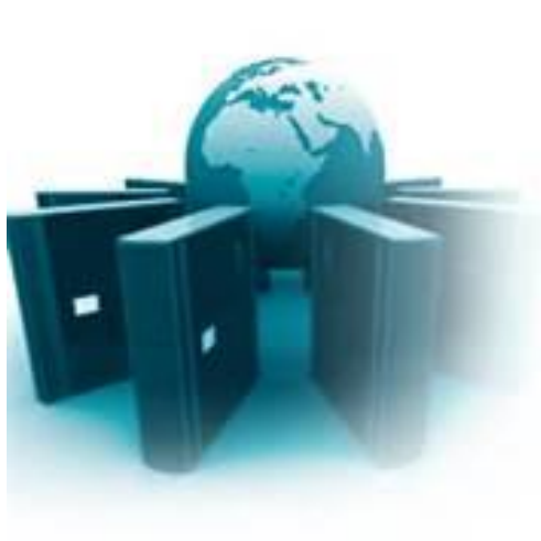
Hybrid IT & Hosted Virtual Appliances