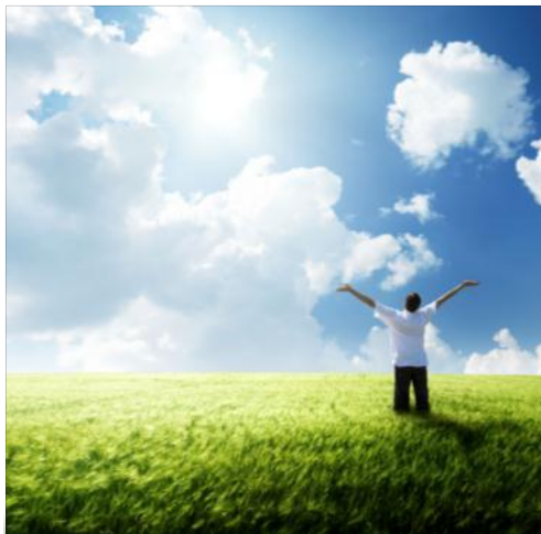
Personal Cloud & Seamless Device Exp.