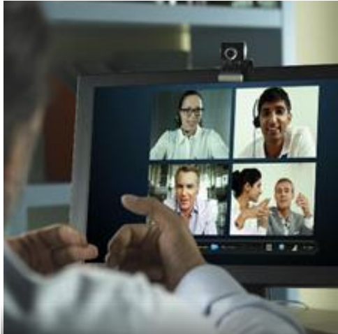
Business & Niche Social Computing

Business and Social Niche Computing: Facebook's ubiquity has led to the proliferation of the niche social network, from photo and video sharing on Instagram and Vimeo, to music and theater lovers using Spotify and Playbill Memory Bank.