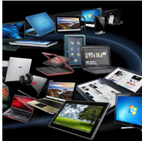
Integrated Devices & Ecosystems